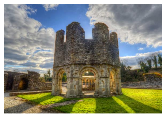
Mellifont Abbey, near Drogheda, Co. Louth

The two largest centers of population in the county are around Dundalk and Drogheda.