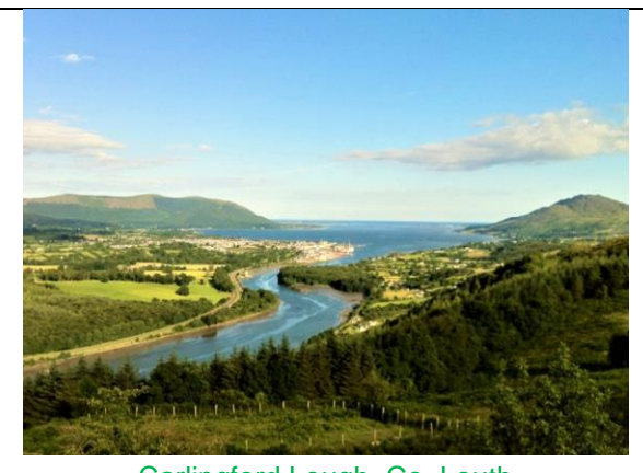
Carlingford Lough, Co. Louth