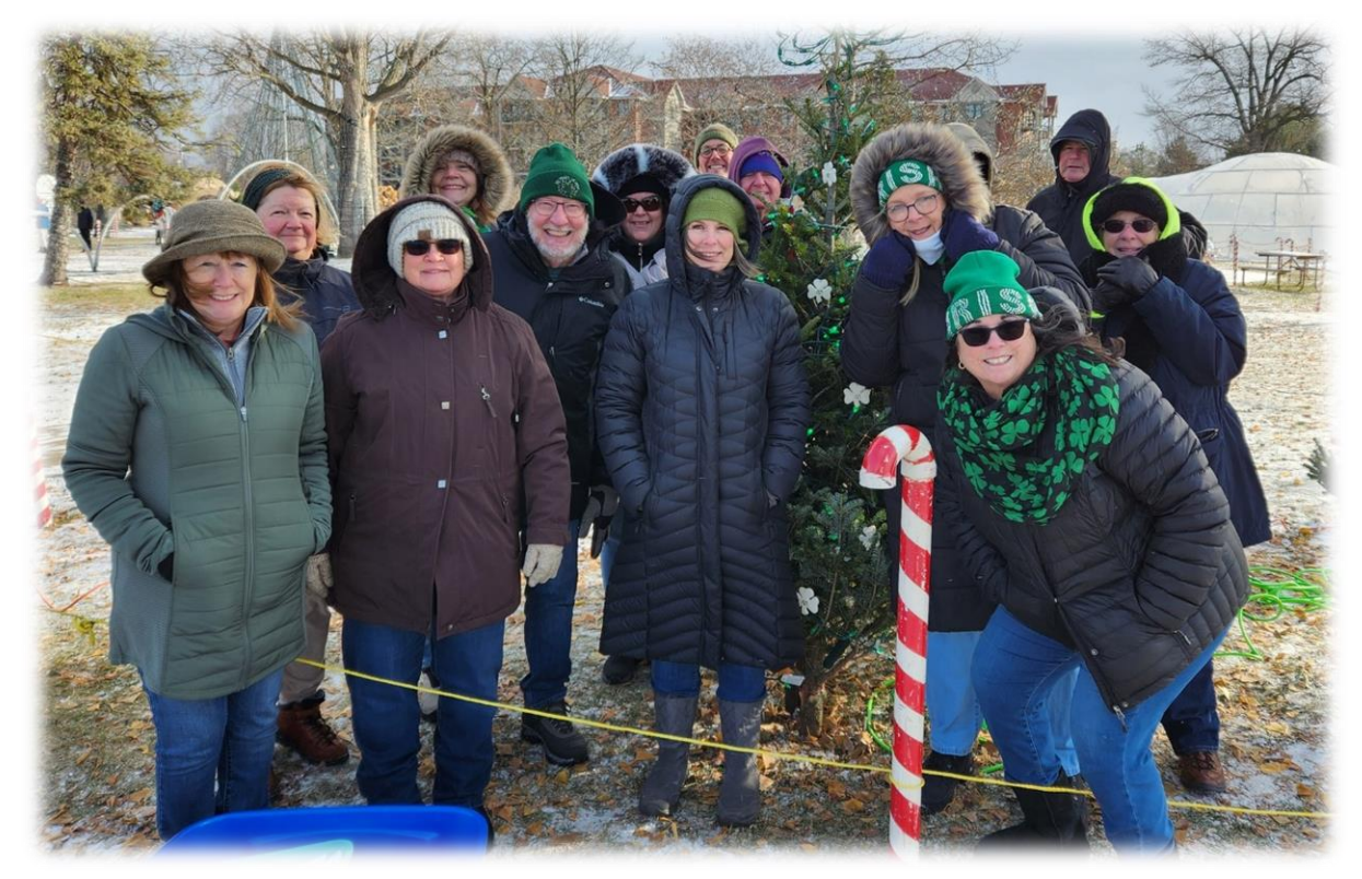
Fourteen Trimmers Trimming