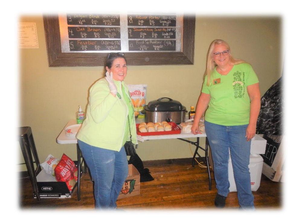
All over for another year.