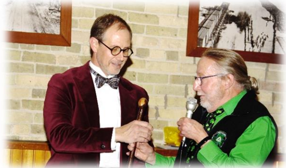
Introductions of the 2023 Irish Rose and Irish Man.