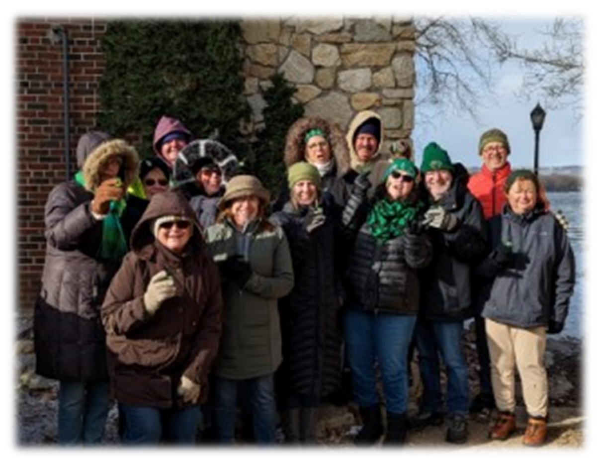
After the Tree Trimming, the annual toast to those club members who have passed away in the preceding year.