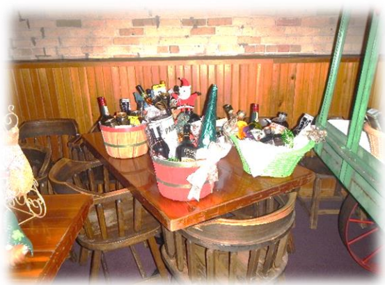
All those lovely prizes.