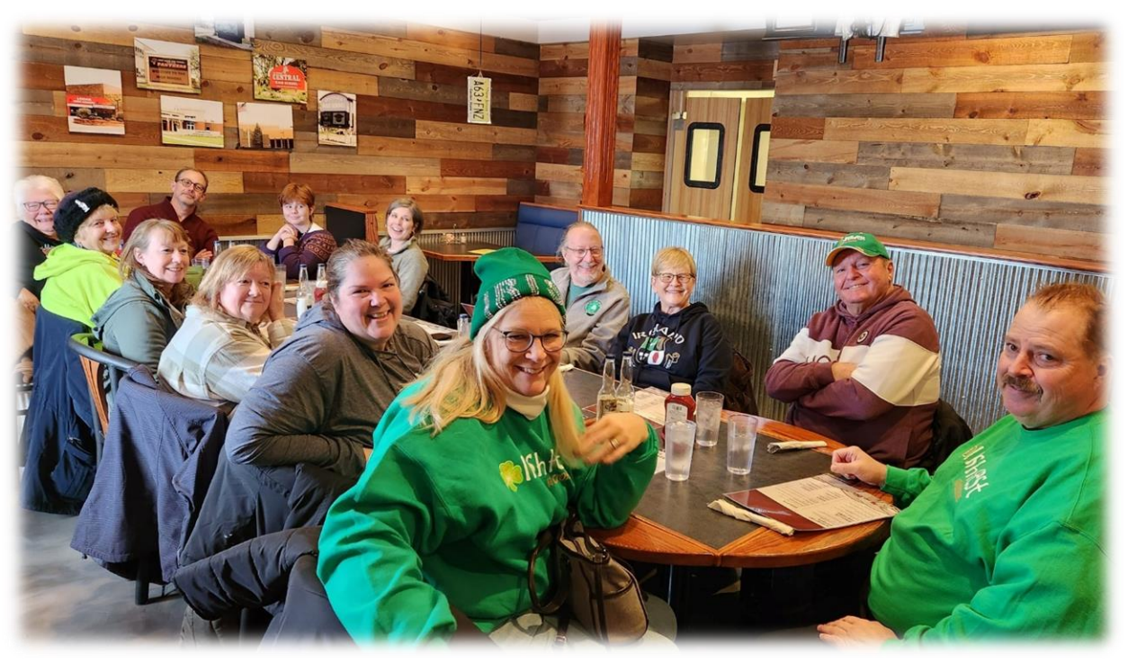
After Trimming, Treats at Ardies after a job well done.