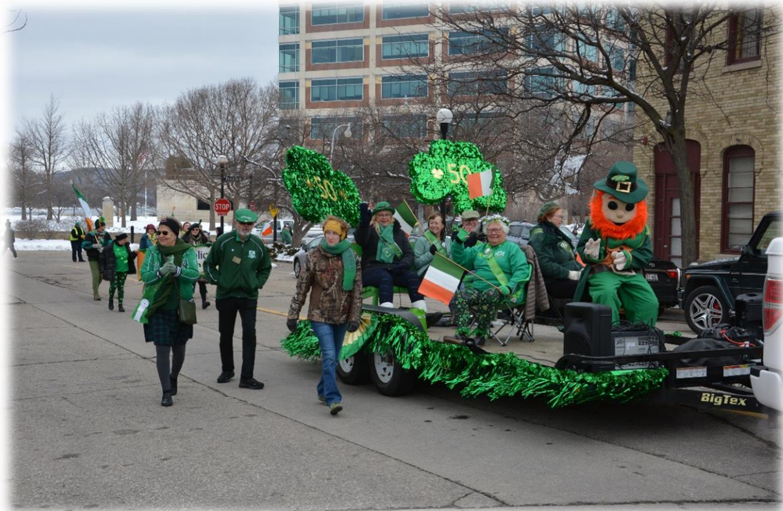
Shamrock Club members walking alongside and riding on the club float decked out in the new 50 th anniversary greenery.