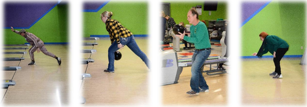
Contrasting methods of delivering the ball down the lane.