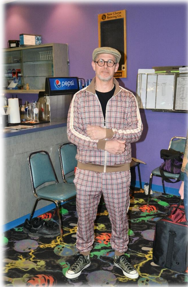
A Picture of sartorial elegance, or, as The Kinks once said, “A Dedicated Follower of Fashion”.