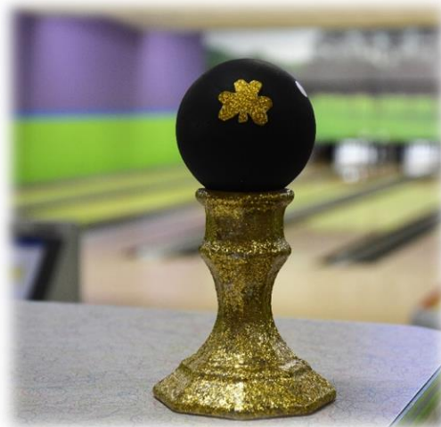
And this is what they were all after, The Shamrock Club Bowling Trophy.