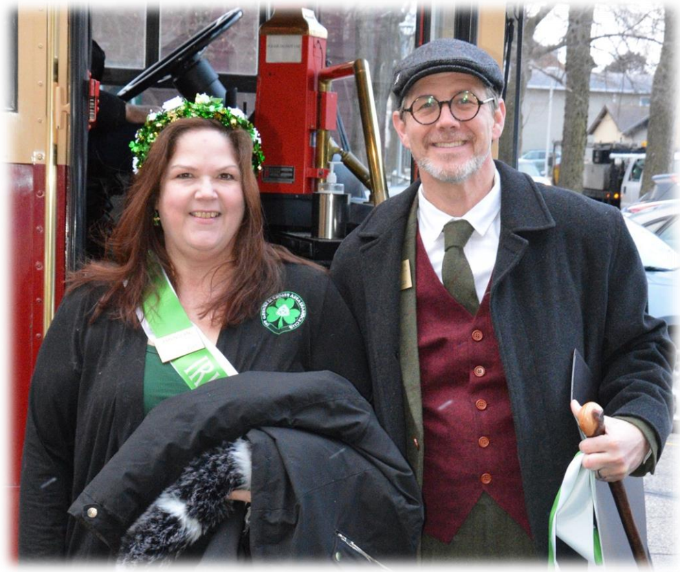
Our 2023 Rose and Man, and below, their means of transport for the day.