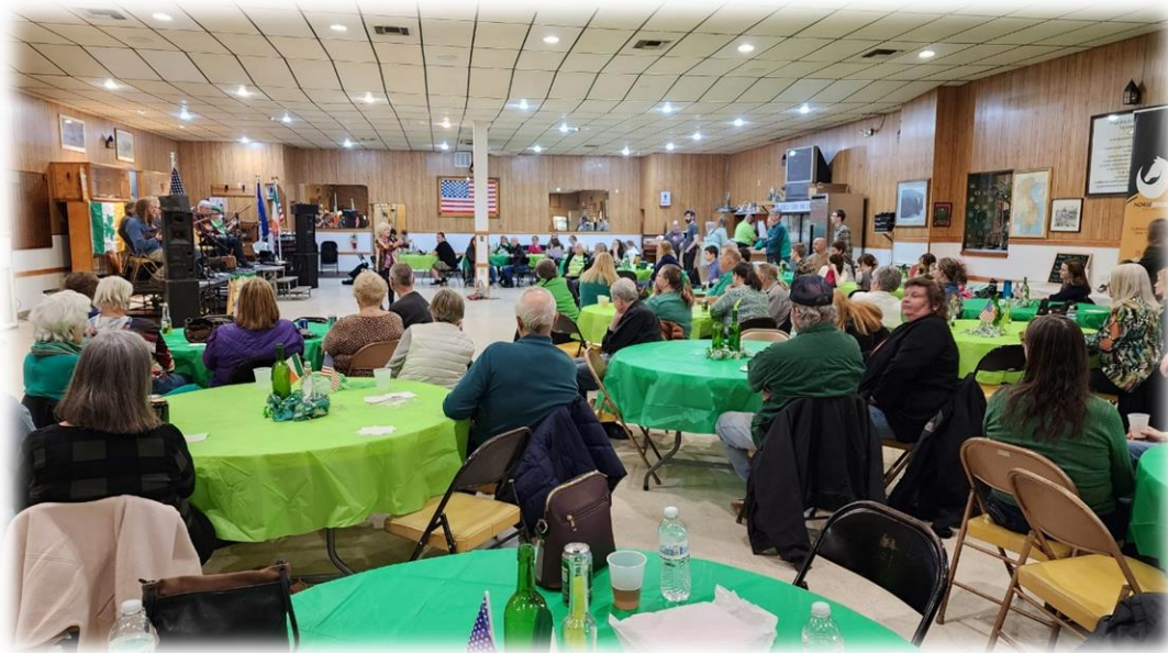
A grand turn out for the Hoolie