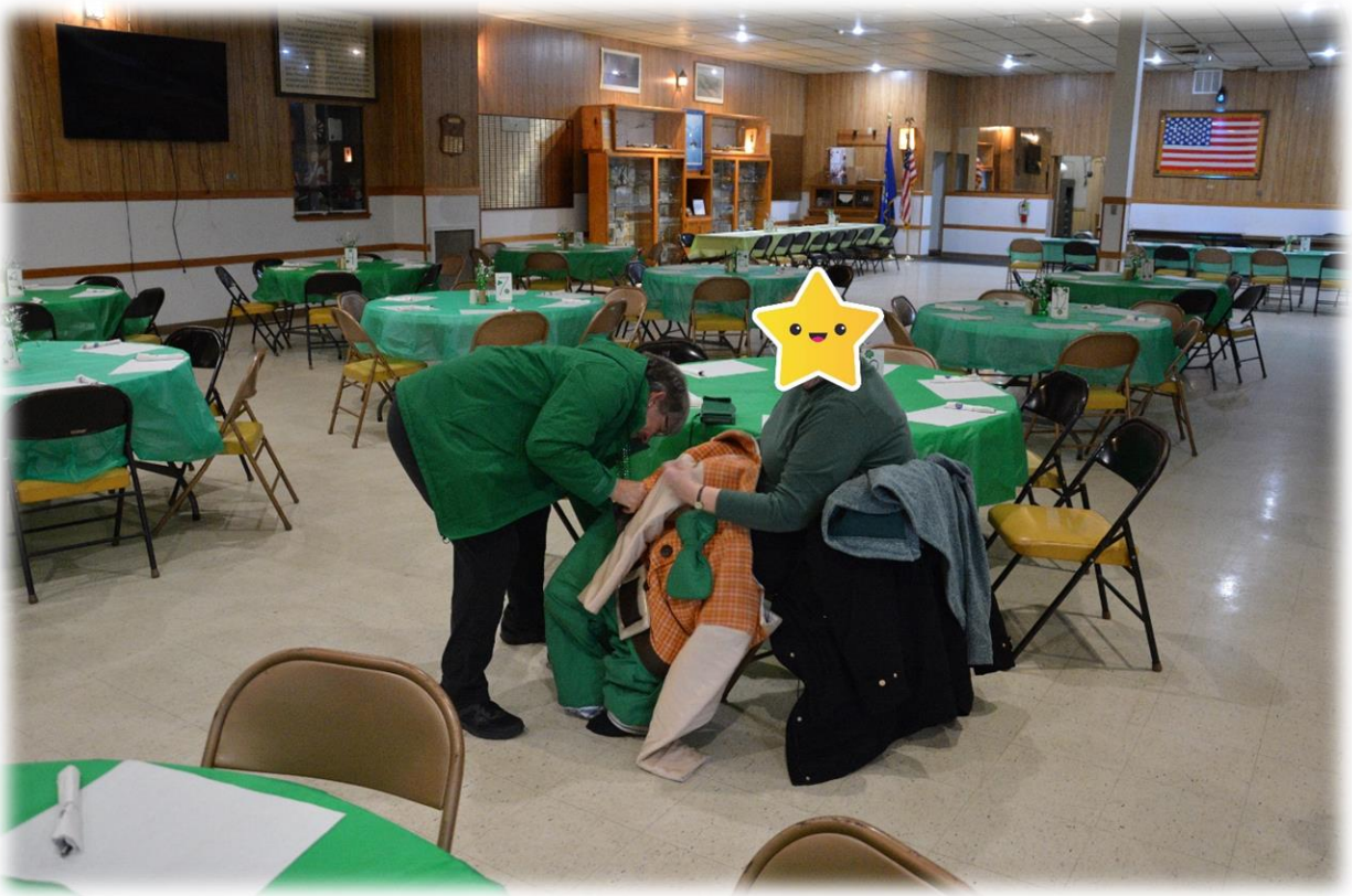
And who will be Clancy today/