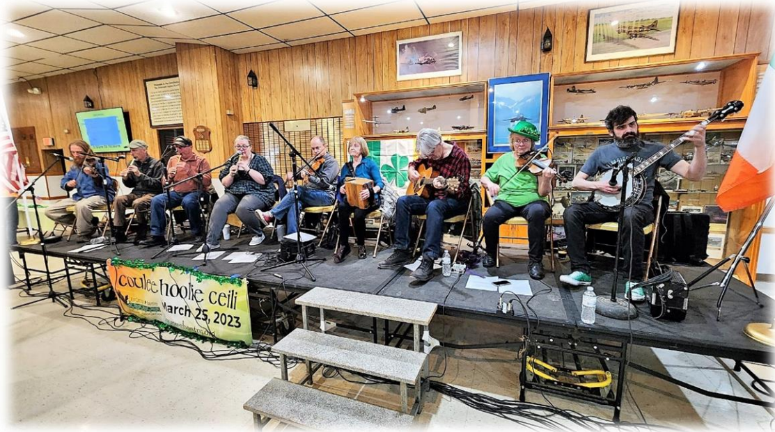
The Coulee Hooligans

The La Crosse Bantry Friendship Association and especially the Coulee Hoolie Ceili (CHC) planning committee, have been quite busy the past 3 months, preparing for our annual fundraiser which was held March 25 th at the La Crosse American Legion.