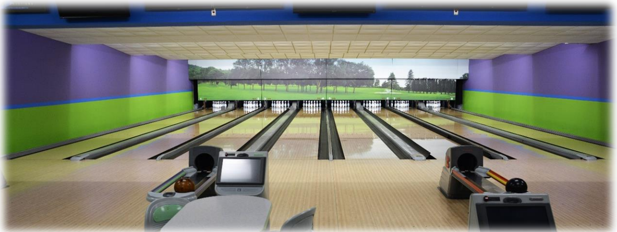
The Venue – Coulee Golf Bowl, before the carnage started.