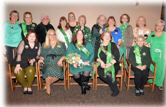
Irish Men and Irish Rose's past and present.