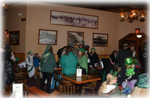
Pre parade shenanigans at The Freighthouse